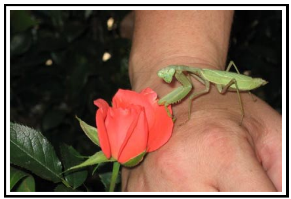
"Grasshopper" by Kathina Szeto Kathina's backyard 12/17/05 Canon Powershot.